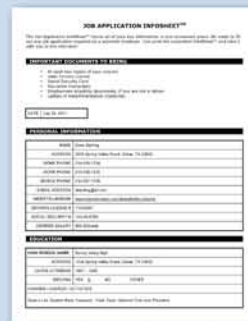
New! Job Application InfoSheet™

Save Time! Job Application InfoSheet keeps all your information stored in one convenient place. Be ready to fill out any job application required by a potential employer. Just print the InfoSheet and take it with you to the interview!