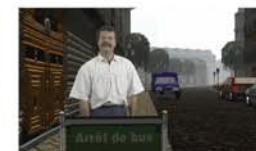
Ask for Direction