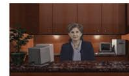
Check into a Hotel