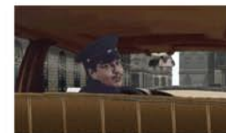
Take a Taxi