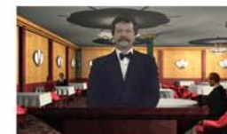
Order a Meal