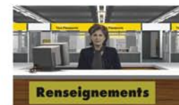
Pass through Security