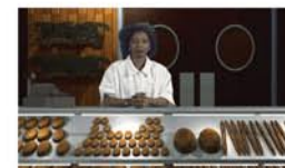
Visit a Bakery