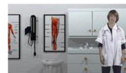
Speak with a Doctor