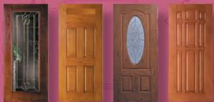
Select custom doors from leading manufacturers.