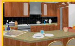
KITCHEN & BATH REMODEL