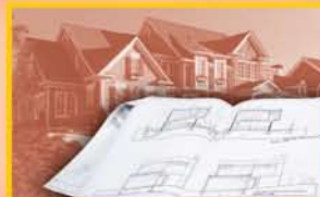
SITE PLANNING & BLUEPRINTS