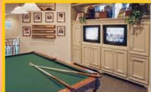
ADD-ONS & BASEMENTS