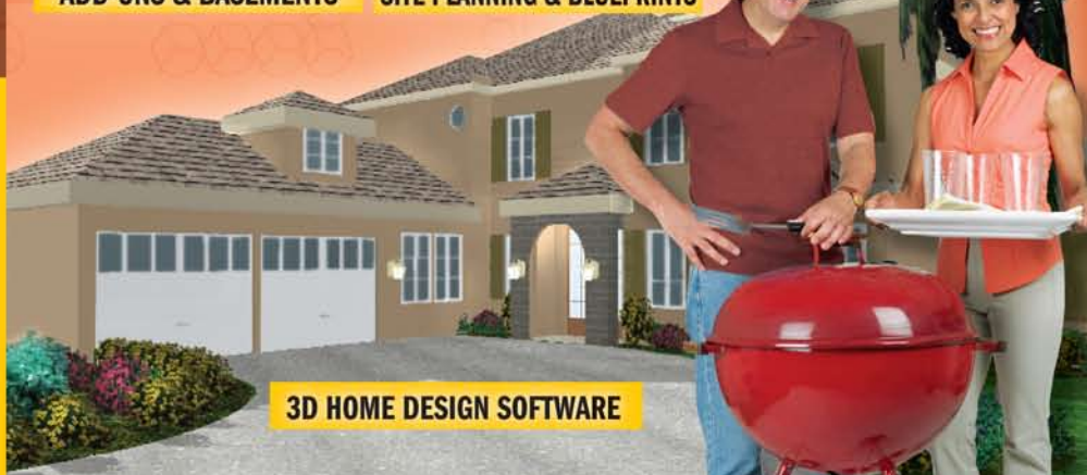
3D HOME DESIGN SOFTWARE