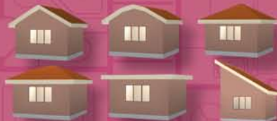
Select from a variety of roof types.