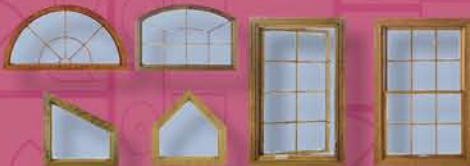
Design with a large variety of windows.

Choose from over 40 window and door designs. Then modify any dimension, color, or style to fit your design. Choose from Hip, Gable, Gambrel, Flat, Shed, or Mansard roofs. Adjust the angle and pitch for a custom design.