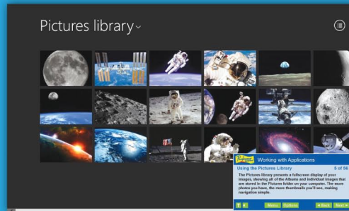
Explore the new Windows 8.1 Pictures Library.

Windows 8.1 allows you to access and share your information in new ways when you learn the essential concepts from Professor Teaches. Comprehensive training begins with the Start Screen and apps, including how to navigate Windows 8.1, Using Tiles, How to Search, and all topics related to this new front facing interface. Learn to Arrange Your favorite Live Tiles, Add RSS Feeds, Customize Your Settings, Use the Browser, Explore Print Features and Peripherals, Use the Desktop, Work with Files and Folders, and more! This fully integrated interactive tutorial is organized for fast and easy learning with practical exercises to build new skills and Windows 8.1 proficiency.