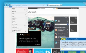
Explore the new features in Internet Explorer.