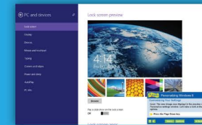
Learn to personalize Windows 8.1.

Increase your productivity using the completely redesigned Windows 8.1!