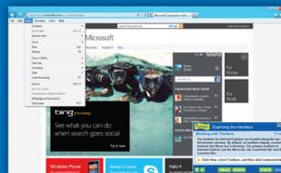
Learn the new features in Internet Explorer 10.

New! Learn Internet Explorer 10. Build your skills and learn everything you need to fully utilize your web browser. Learn to use the features of the browser in the Windows 8 Interface.