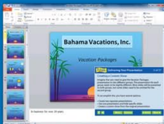
Learn new ways to create dynamic presentations.